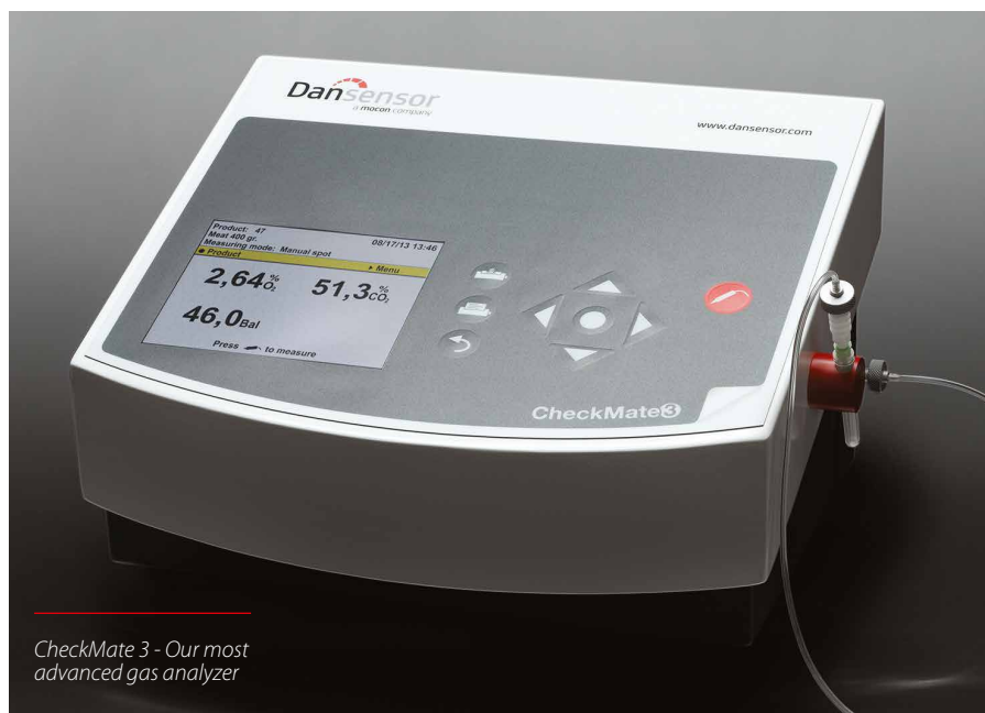
CheckMate 3 - Our most advanced gas analyzer