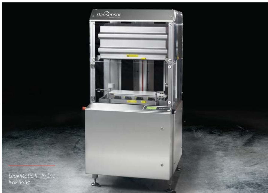
LeakMatic II - In-line leak tester