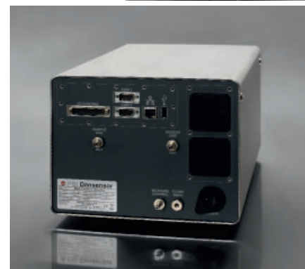
Dash-gastec-MAP Check 3-EN-4